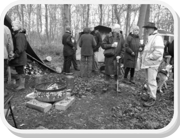
A recent walk took 'Alvechurch Walking Buddies' down the canal to Dunnage Woods

The group are always looking for new members to join them and is a great opportunity for people to meet old friends and make new ones.